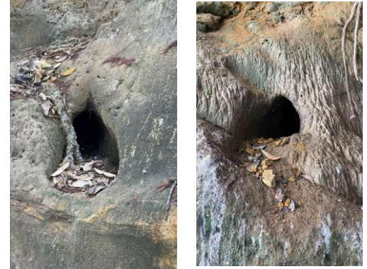
Unoccupied penguin burrows, used for practice with burrowscopes.