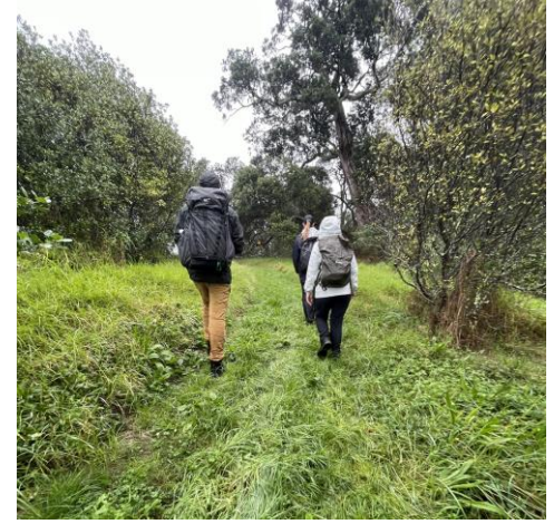
Volunteers walking to potential burrow sites.

In December we received official burrowscope training from one of the Auckland Council's Senior Seabird Scientists, Gaia Dell'Araccia